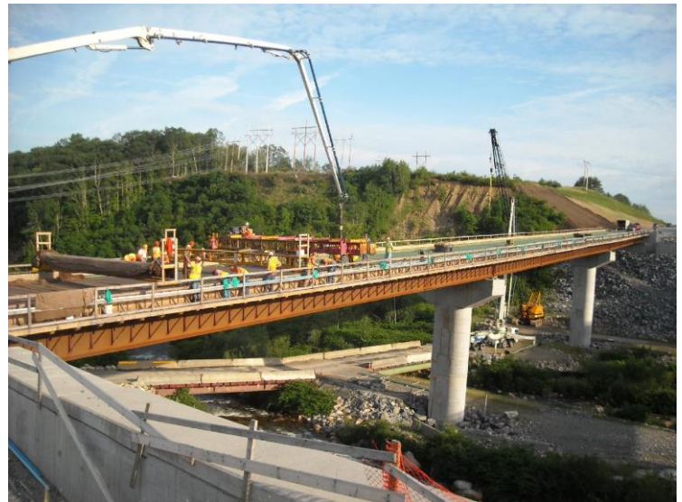
Concrete bridge deck placement.

To receive approval for a mixture, the PCC facility must develop a homogenous PCC mixture using only approved materials listed under Standard Specification 501. This mixture must meet the performance requirements associated with the application, and be designed in accordance with ACI 211.1 (Standard Practice for Selecting Proportions for Normal, Heavyweight, and Mass Concrete) and the provisions of AASHTO R101 (Developing Performance Engineered Concrete Pavement Mixtures). New mix designs must be submitted at a minimum of 60 days prior to placement to provide time for review and evaluation of trial batch results.